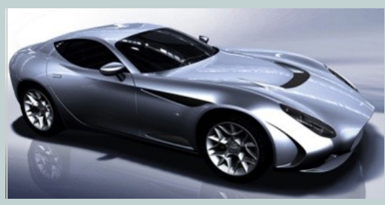
The Perana Z-one styled by Zagato of Italy, built by HiTech Automotive in Port Elizabeth.

NMMU Racing to Compete 2 in Knysna Hillclimb